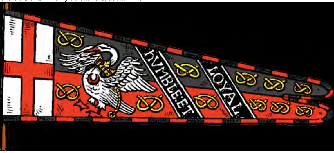
Standard of Sir Henry de Stafford, about 1475

Livery : clothing of specific colors typically marked with a badge to show that someone is in service to another. These colors need not be heraldic ones (Tawney appears to have been popular in Tudor England). The clothing may be of one color, or of several; in the Adrian Empire, two colors seem popular, but this not required. The badge is typically worn on the left breast, over the heart.