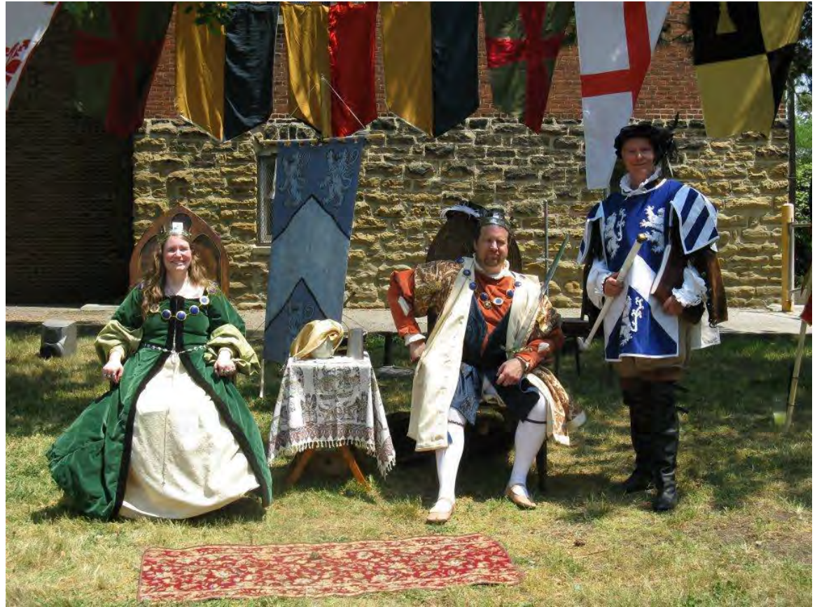
Coronation of Ansel and Constance of Somerset, 2011, featuring a tabard on our herald and the Ancient Banner of Somerset (ca 2003)

In closing, we should be using heraldic display today just as they did in period – to add color, to identify people and their titles and offices and as rallying points. Perhaps the finest way to do this is by working on our own heraldic display and that of our office. To fire your imagination, I attempt to put aside my modesty to give you the following examples: