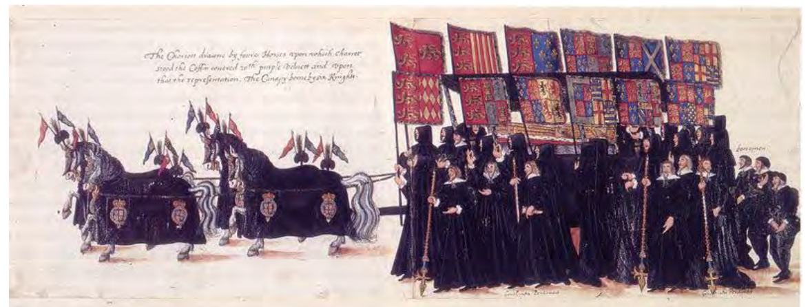
Funeral of Queen Elizabeth I of England